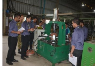
Industrial Visit to M & U cycle Ltd

Faculty and the students of IPE department visited to M & U cycle Ltd. on 08 April 2017. Students explored the industrial aspects of bicycle manufacturing and they gathered real-time experiences over automation, manufacturing line, quality inspection and so on.