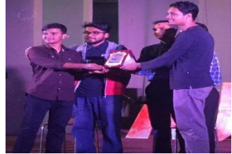
Champion “Hellaflush” team

A group of three students from IPE-1 participated in an Automobile Quiz Competition organized by BUET Auto Mobile Club on December 2017 in BUET. The team was named “Hellaflush” .They had beaten all teams from other universities and secured the prestigious first position in the competition.