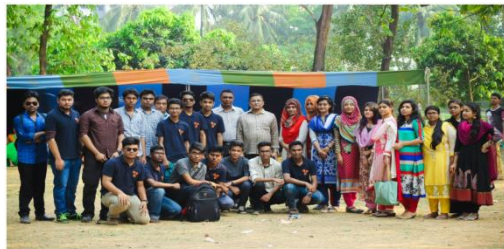
Picnic of IPE department

An annual picnic is organized every year to give students a break from their mundane life. This break not only helps them to refresh their mind but also strengthens inter departmental bond.