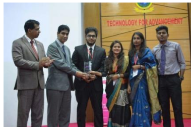
First Runners up Alacrity team