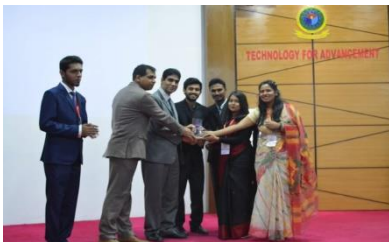
Champion Mavericks team

HULT prize is the most renowned and prestigious Business Case Competition which address various social problems. In “HULT Prize 2018 at MIST” two teams from IPE department secured the first position and the first Runners up position. The team named Mavericks were the champions and the team named Alacrity was first Runners up.