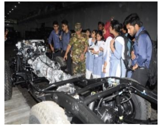
Industrial Visit to BMTF

Faculty and the students of IPE department paid an industrial visit to Bangladesh Machine Tools Factory (BMTF) on 22 April, 2017. The objective of the industrial visit was to help the students acquire practical knowledge on industrial manufacturing and automation processes. Students explored the assembly process of automobiles, manufacturing of electric poles & different kinds of shoes.