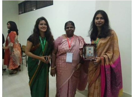
IEEE R10 HTC 2017 WIE Track: Best Idea Presenter Team- “The Dreamers”

A team from IPE-1 named “The Dreamers” participated in IEEE R10 HTC 2017 WIE Track, where they made a mobile app named “AURA”. This mobile app can help to detect breast cancer and will inform about it in the early stage so that proper steps can be taken. This team got the Best Idea Presenter Award.